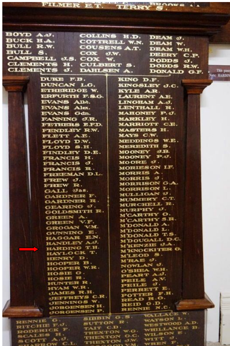
Shire of Bairnsdale Roll of Honour